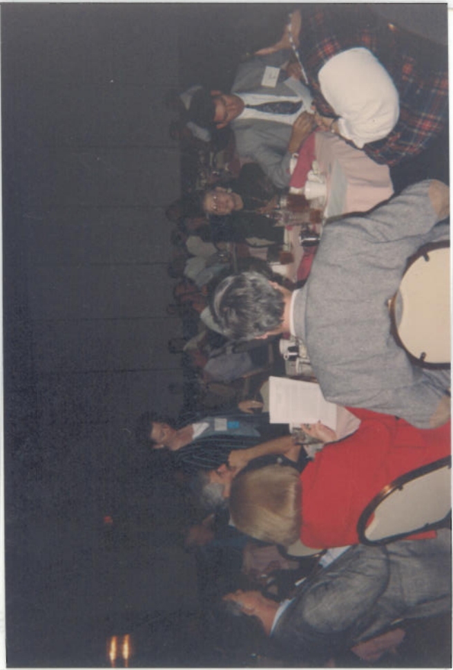
Bottom: VI Republic Top: VI Republic